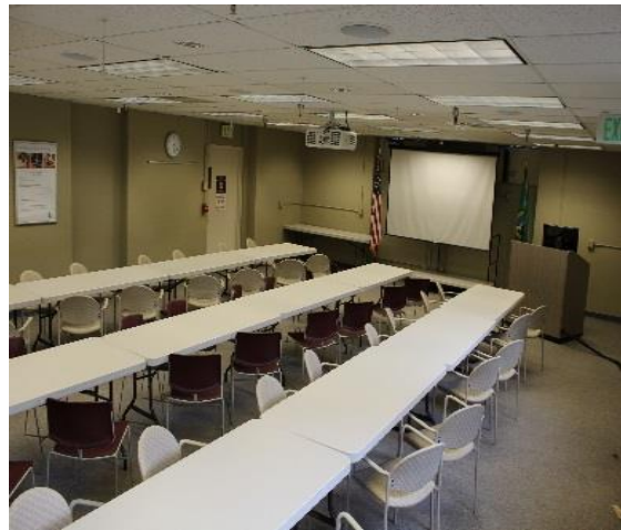
PacMed Ground West 1