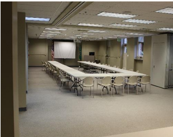
PacMed Ground West 1 & 2