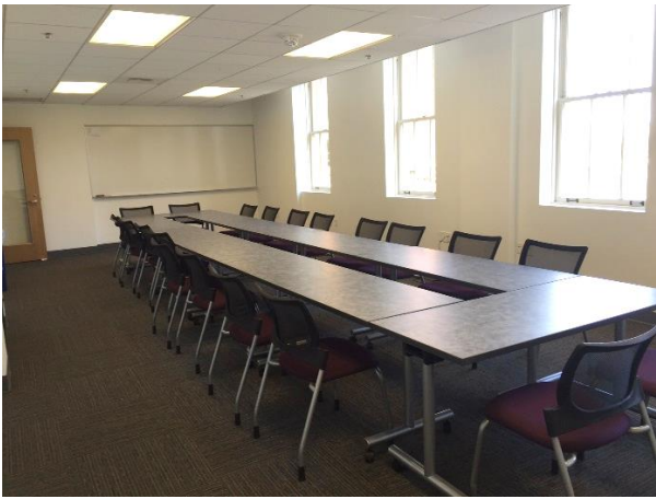
Suite 180 – meeting room 1 st floor East