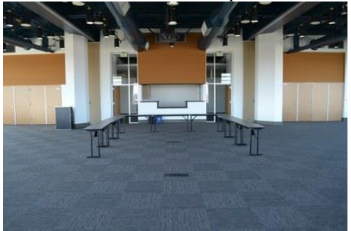
Panoramic Center – conference space