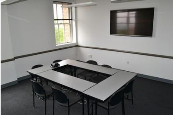
Suite 820 – small meeting room